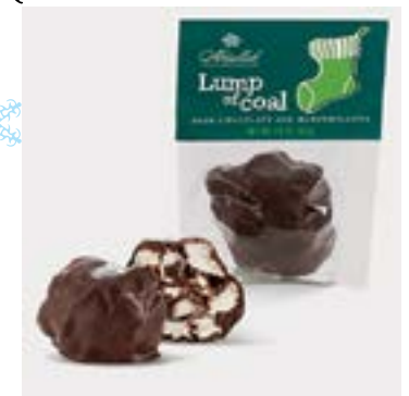
Lump of Coal