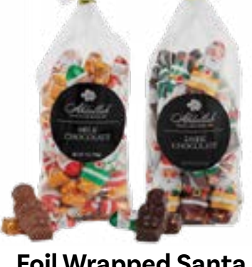
Foil Wrapped Santa Milk or Dark chocolate Santa wrapped in foil. 7.5 oz bag $8.50