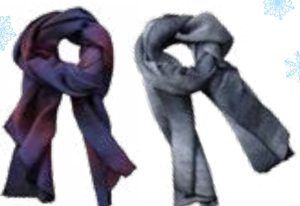
Ombre Ridged Scarf Black/Gray, Blue/Turquoise or Navy/Reg