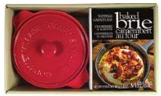
Red Brie Baker Kit with Cranberry Almond Topping