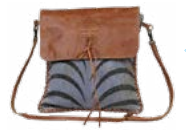
Nature's Pride Crossbody Bag

Designed for a lifestyle celebrating the importance of the little thing