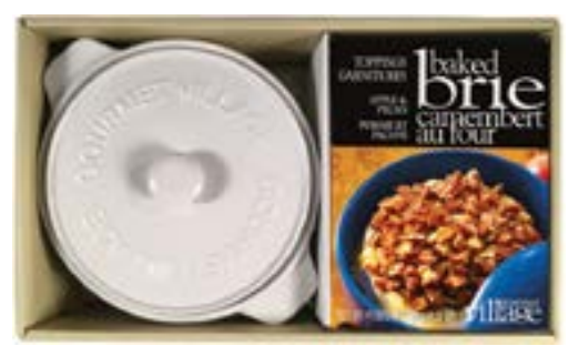
White Brie Baker Kit with Apple Pecan Topping