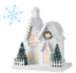
Double Gable House 10.75 inches $39.99

Make your very own winter wonderland village on top of your mantle this holiday season! 8-hour timer repeats every 16 hours. Requires 3 AAA batteries