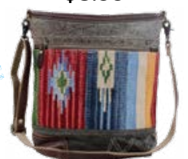
Technicolor Shoulder Bag

Vivid hues exude tropical vibes. Cowhide leather bottom, broad shoulder strap for comfortable carrying.