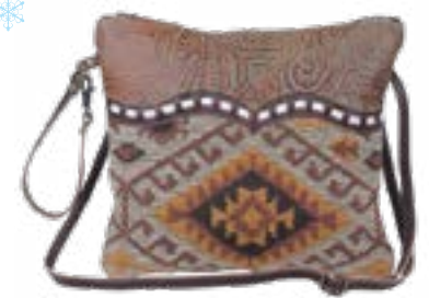
Lilies Crossbody Bag

Sturdy leather in turquoise floral pattern on the top panel, rug design at the bottom. Inner compartments keep your essentials handy.