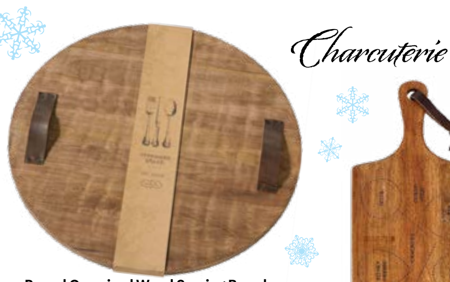
Round Oversized Wood Serving Board Hand-carved with irregular edge, 20" diameter $49.99